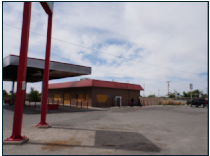
Figure 2: Former Speedway Convenience Store