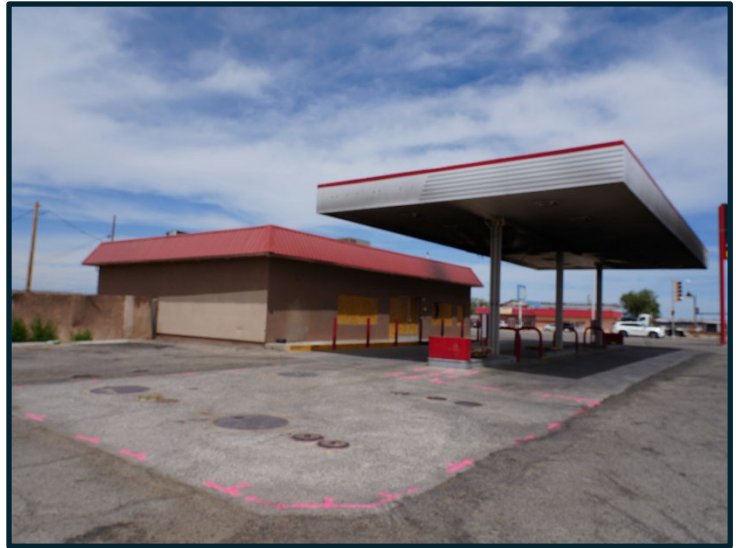
Figure 1: Former Speedway Business Site, Shiprock, NM

The Small Business Development Department, a DED department, maintains a network of Regional Business Development Offices (RBDOs). Each RBDO serves each agency to provide assistance to individuals, small businesses, chapters and other organizations in developing business plans; negotiating and processing business site leasing transactions; obtaining finances; obtaining preference certifications; administering educational seminars