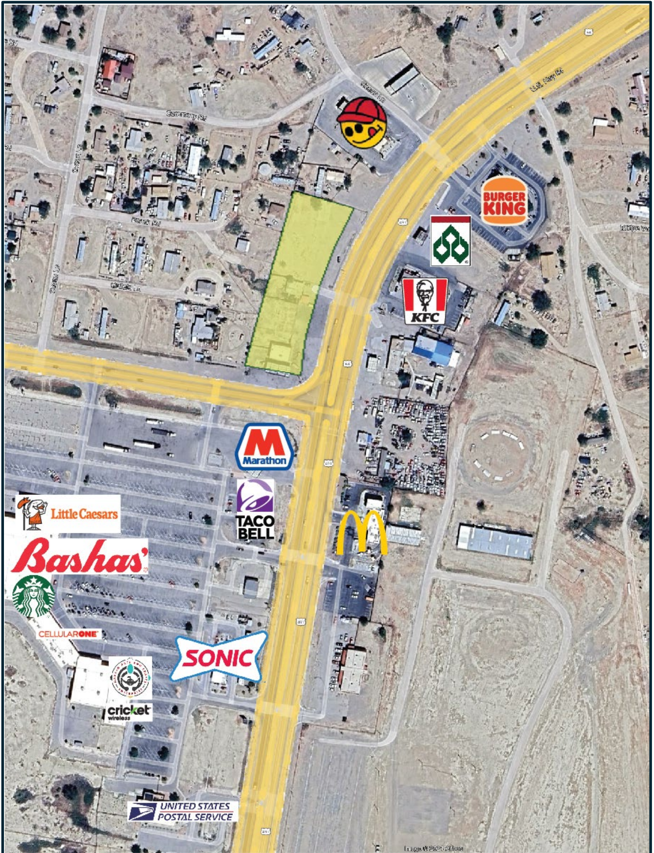
Figure 5: Area retailers, Shiprock, NM